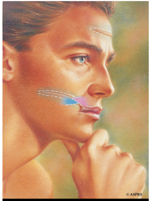
This is an artist's rendering and does not represent actual patient results. Individual results may vary.

Right, pictures show the use of a Z-plasty method to break a scar into better direction and to reduce tension and pulling of the mouth. Excision and narrowing a scar on the forehead.