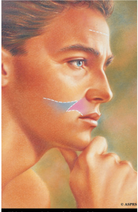
This is an artist's rendering and does not represent actual patient results. Individual results may vary.